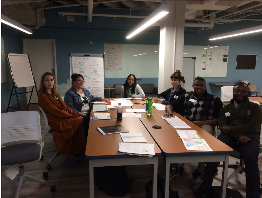
Graduate Student Participants at the Foundations of Project Management Workshop on October 21 & 22, 2017